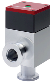
AVC 016 PA, angle valve, pneumatic, without PI, without PV